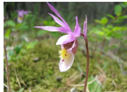
spring blooming Calypso orchid